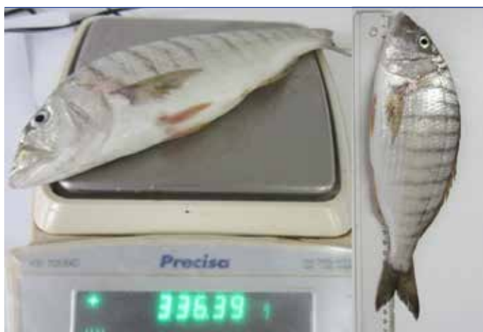
Figure 2. L. mormyrus sampled from Black Sea Region