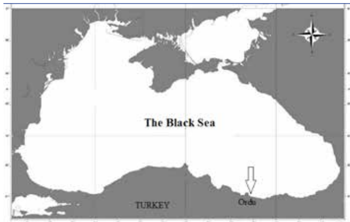
Figure 1. Sampling area

years old. Furthermore, the diameter of the vertebrae from which the age determination was made was measured to be 4478.2 microns (Figure 4).